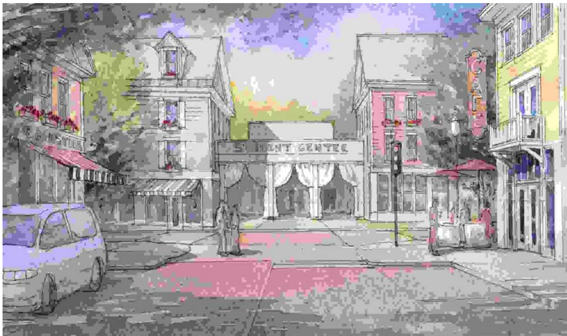
Dover-Kohl, Inc. Smart Growth Rendering of BNAS Reuse