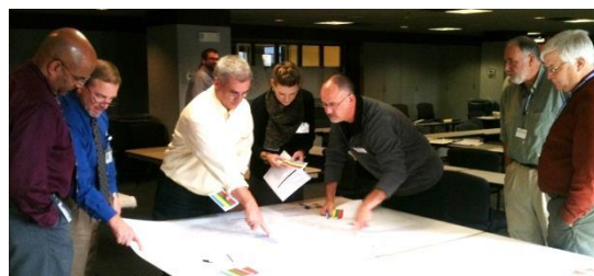
With vulnerable areas mapped, community leaders can make informed decisions about populations and property most in need of mitigation measures.